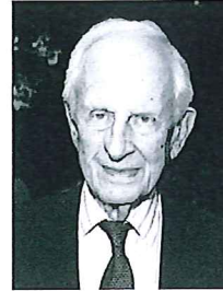
Honorable Robert M. Morgenthau District Attorney, New York County, Manhattan

Robert M. Morgenthau is the District Attorney of New York County.