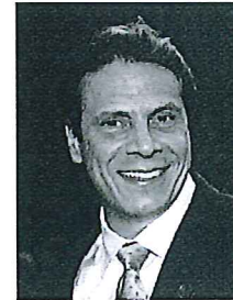
Andrew M. Cuomo Attorney General, New York City

Andrew Cuomo was elected the 64th Attorney General of New York State on November 7, 2006. As Attorney General, Cuomo is the highest ranking law enforcement officer for the State, responsible for representing New York and its residents in legal matters.